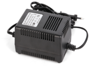
AC24V/3A Power Supply